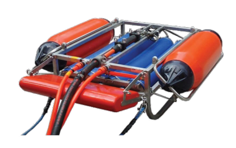
400 tips version.